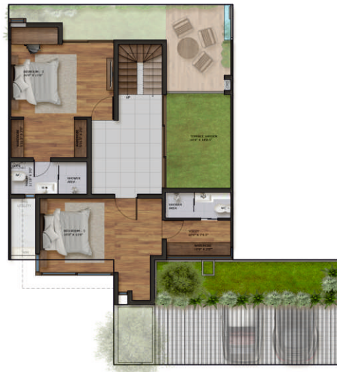
East Facing Corner Villament First Floor