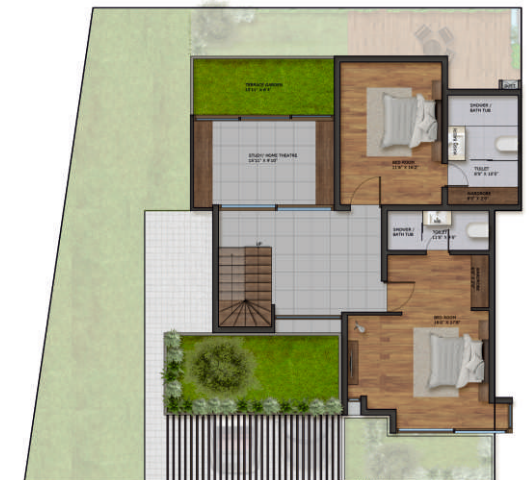
West Facing Corner Villament First Floor