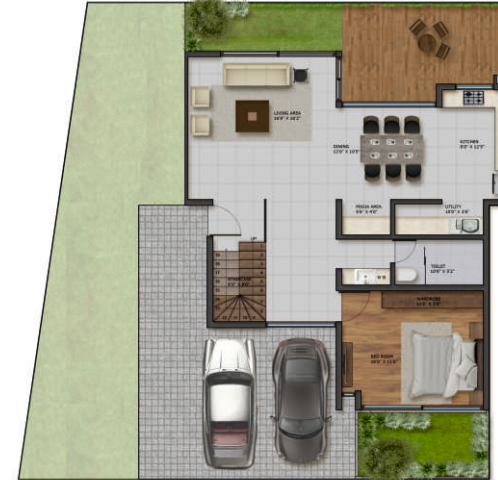
West Facing Corner Villament Ground Floor