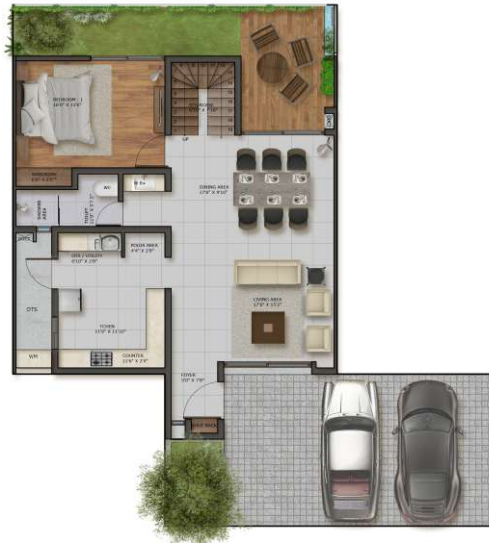
East Facing Corner Villament Ground Floor